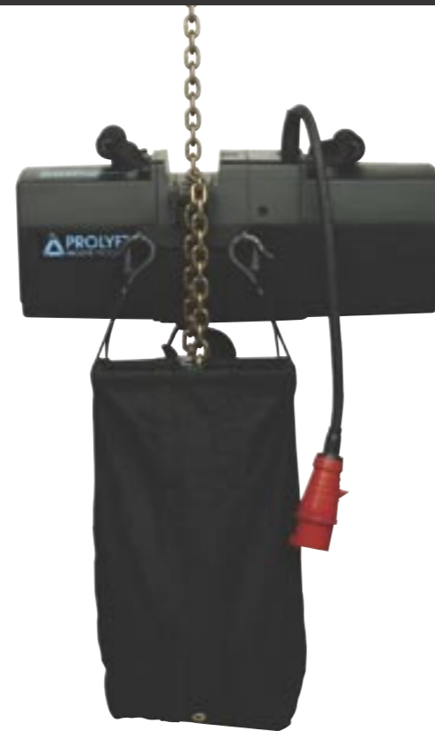
500 / 1000 Kg version