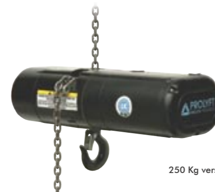
250 Kg version